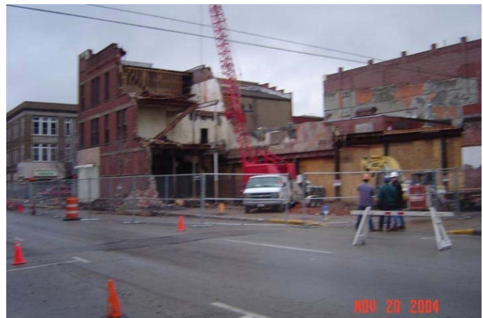
Demolition of the Busby building